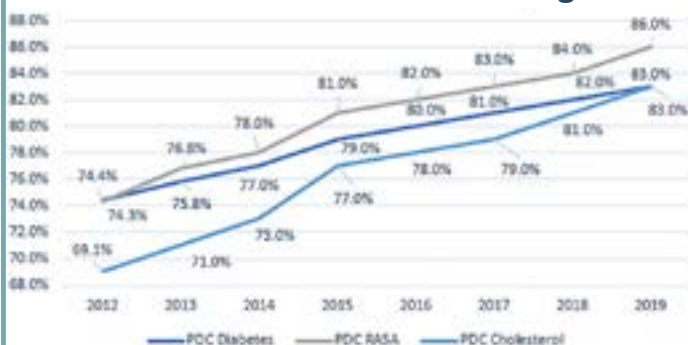
PDP - Adherence Measure Averages